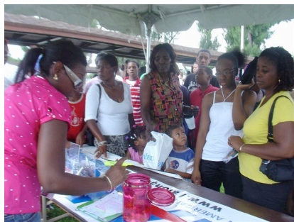
HALO volunteer hands out school supplies and gifts at the Fourth Annual Wellness Day at Arcola Lakes Park on 8/4/07.