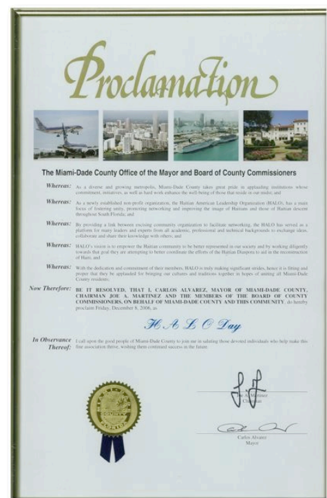
Dec. 8, 2006 proclaimed HALO Day by the Miami-Dade County Office of the Mayor.

HALO responds with a unequivocal, "Absolutely not!" Part of our vision is to hopefully transcend the organization's objectives through gender, ethnicity, and religious differences with the ultimate goal of reaching out to the people back home in Haiti.