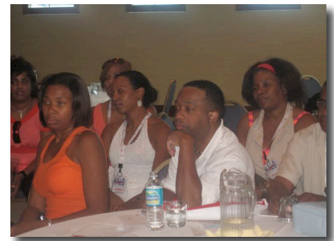
Participants at the HALO Retreat in Naples FL in June 2007.